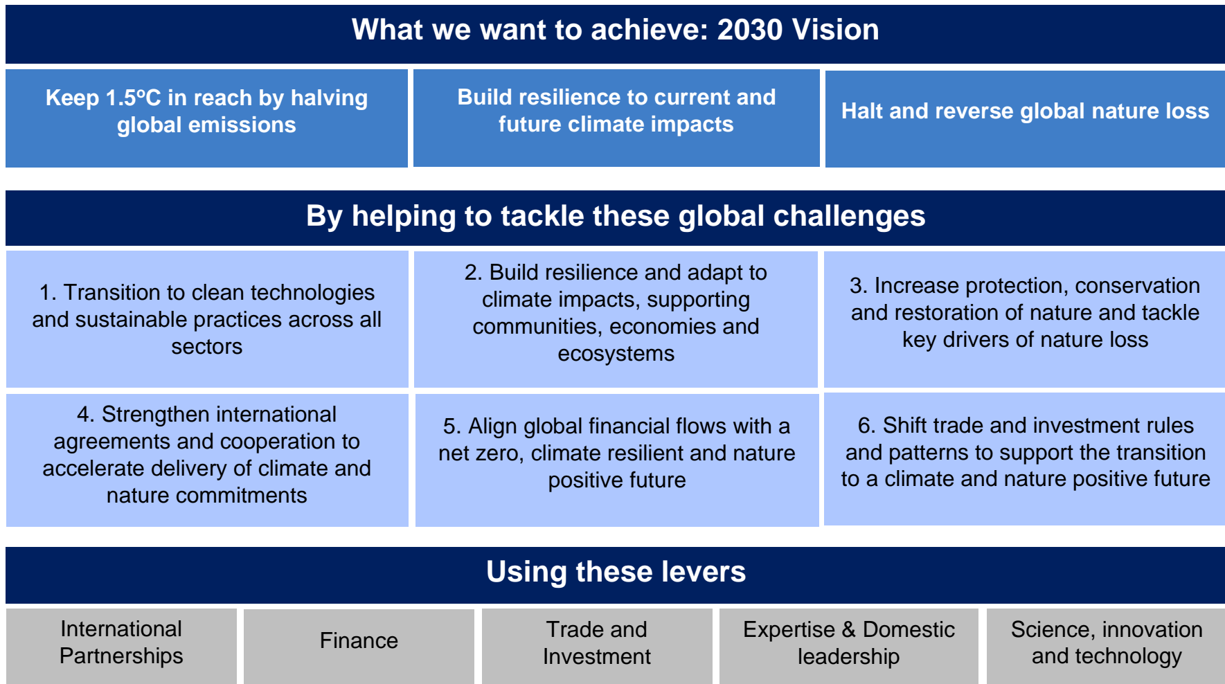
Figure 1: Overview of the 2030 Strategic Framework