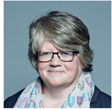
The Rt Hon Thérèse Coffey MP

Secretary of State for Energy Security and Net Zero