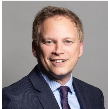
The Rt Hon Grant Shapps MP

Foreign, Commonwealth & Development Secretary