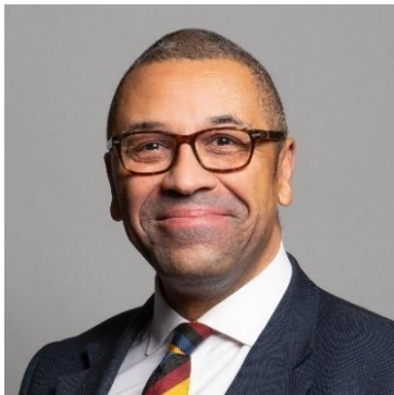
The Rt Hon James Cleverly MP

To deliver on the Glasgow Climate Pact and the Kunming-Montreal Global Biodiversity Framework, we must now move from words to action. This is why we are publishing our 2030 Strategic Framework setting out how we will drive forward international action on climate and nature in an integrated way. Alongside this we are also publishing our International Climate Finance Strategy, underpinning our commitment to double International Climate Finance (ICF) to £11.6 billion by 2025/26, including £3 billion on nature. The 2020s must be a decade of climate and nature action. Our common security and prosperity depend upon it.